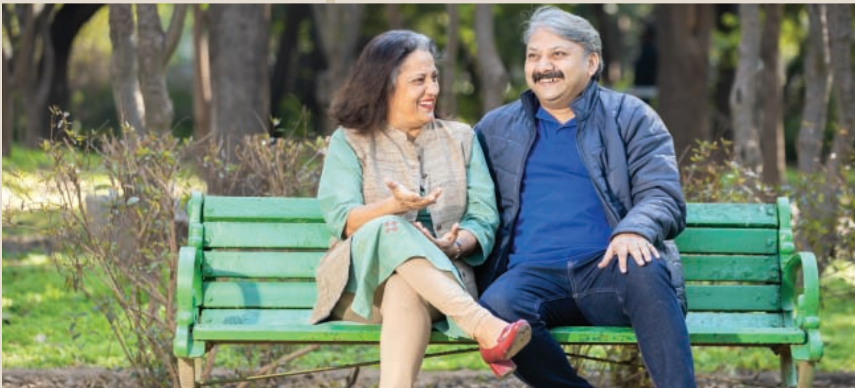
LEISURE SITTING AREA