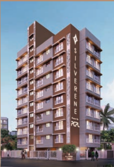
SILVERENE Malad (W)