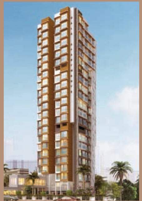
GALA Malad (E)