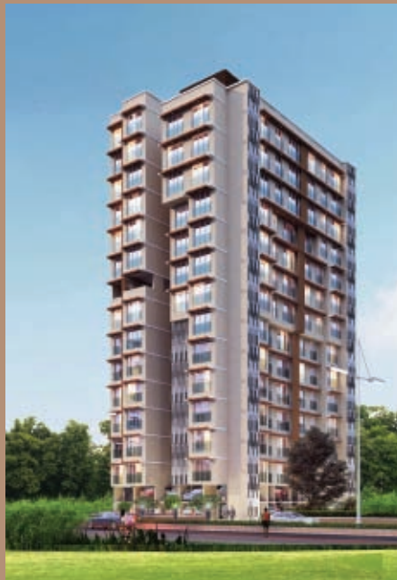
SPARSH Malad (W)