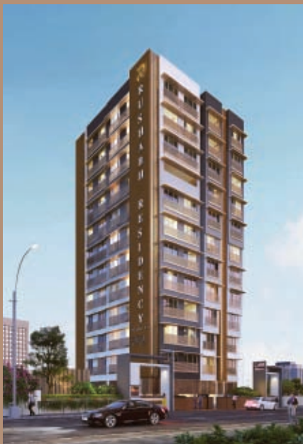
RUSHABH RESIDENCY Malad (E)

PCPL don't just build homes, they build memories with several such loving homes have become their legacy.