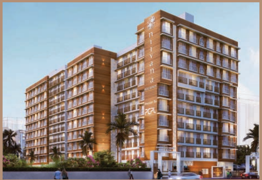
NIRVANA Malad (W)