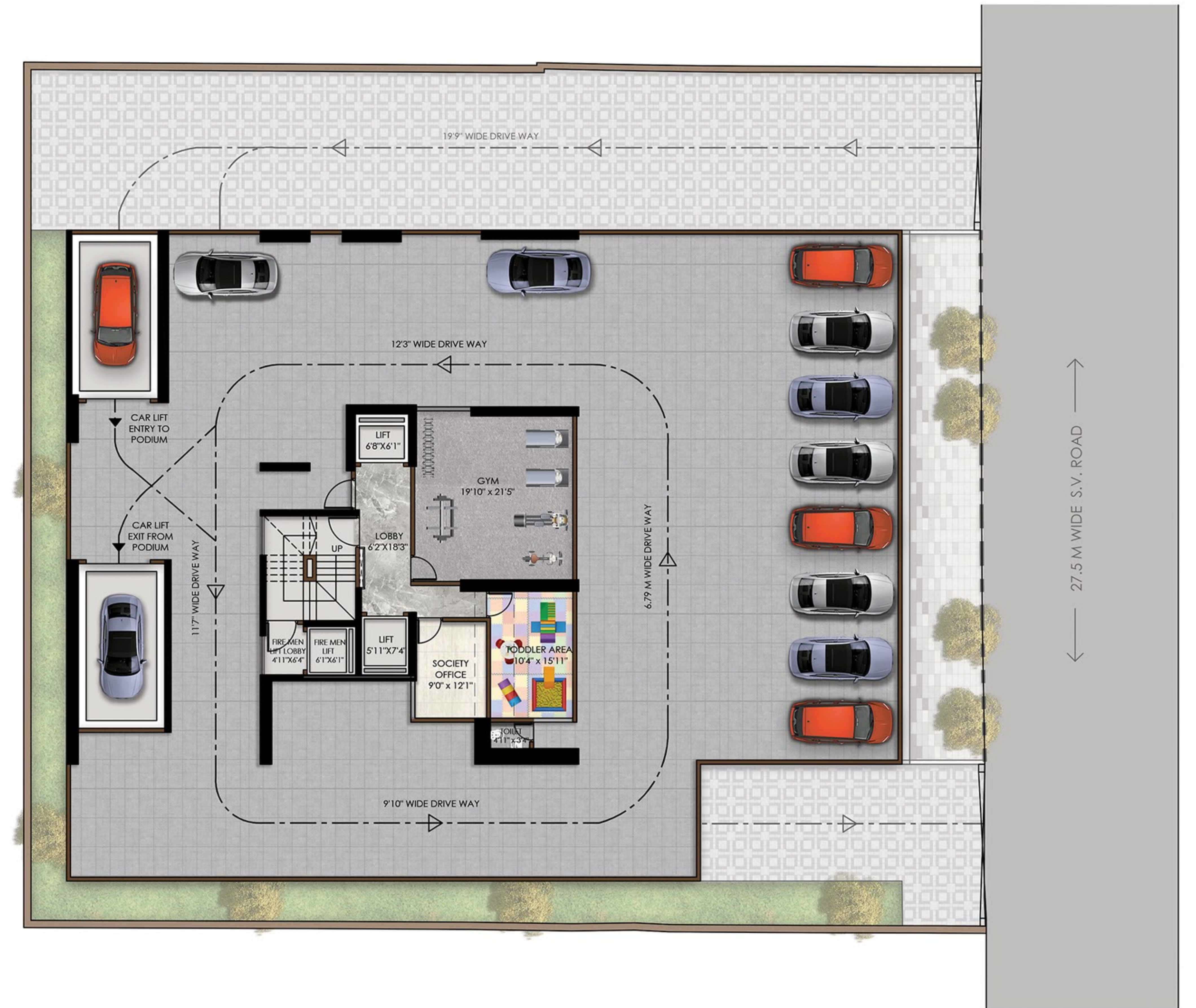
2nd Podium floor