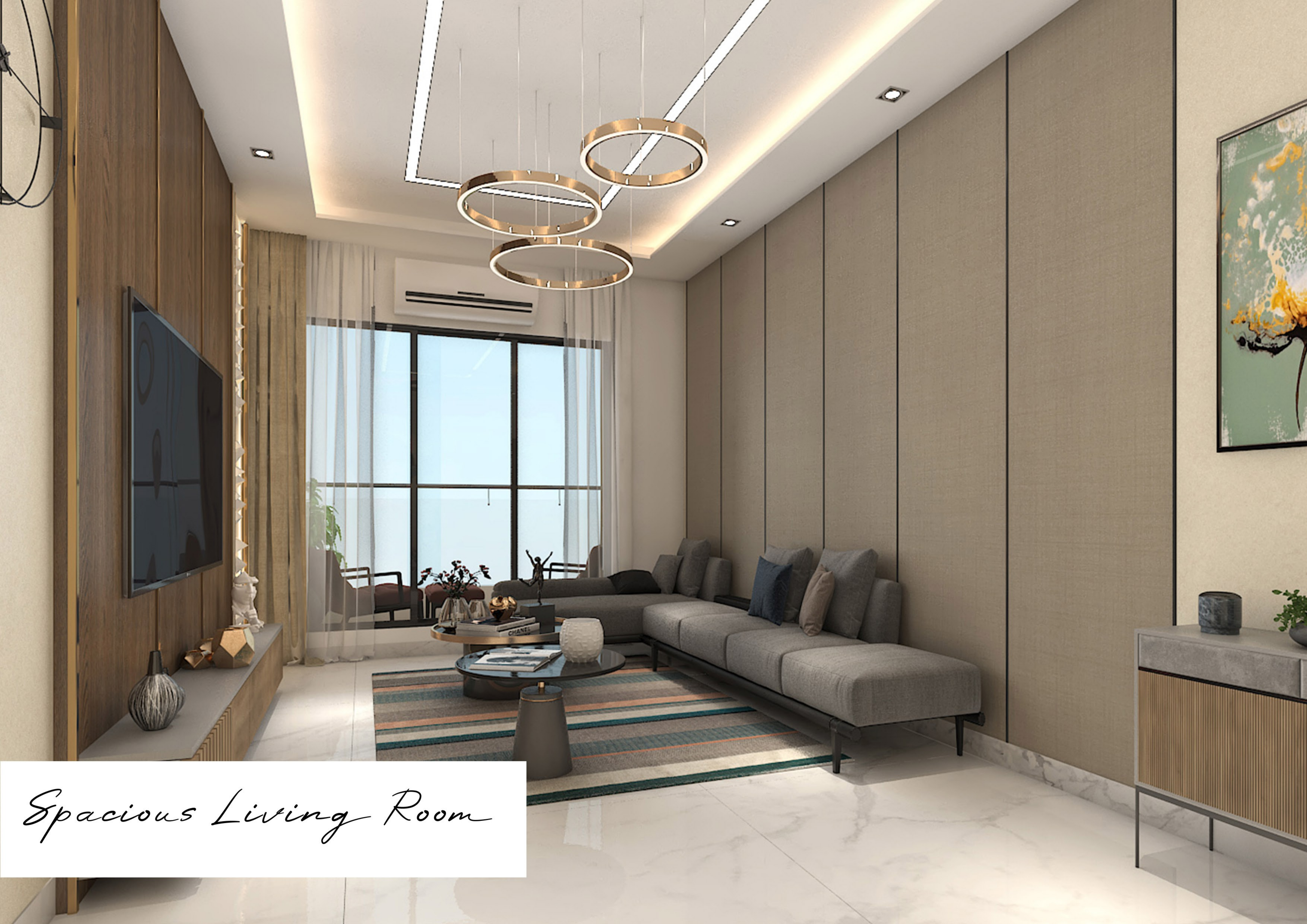
Spacious Living Room