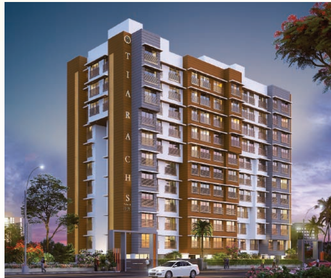
TIARA Malad (W)