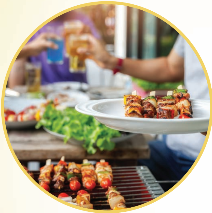
Barbeque Area And Party Deck