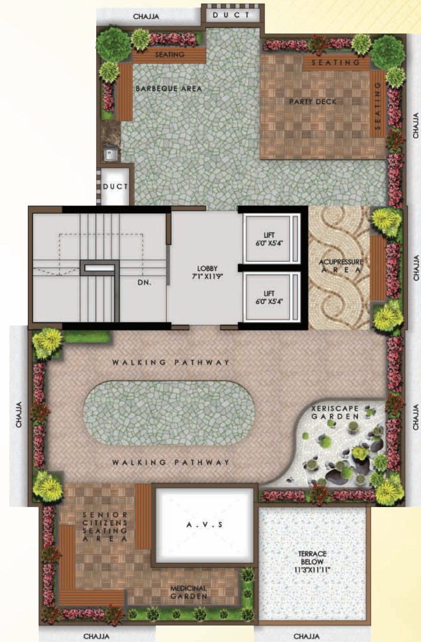
Terrace Floor Plan