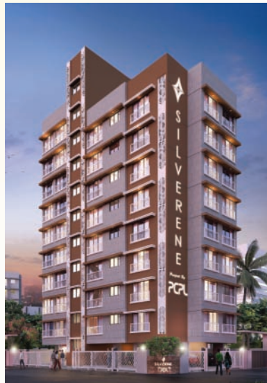
SILVERENE Malad (W)

A pioneer in the space of affordable luxury homes, PCPL has successfully developed and delivered over 3,00,000 sq.ft of top-quality residential and commercial properties. PCPL don't just build homes, they build memories with several such loving homes have become their legacy.