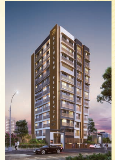
RUSHABH RESIDENCY Malad (E)