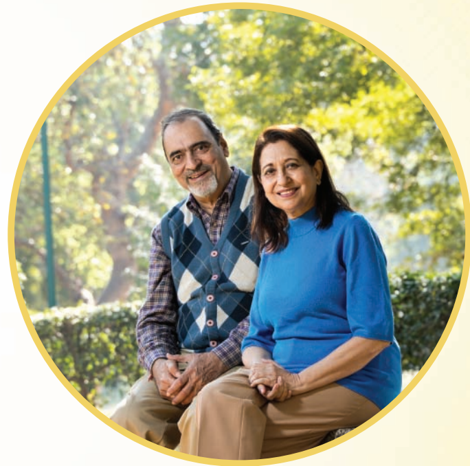
Senior Citizen Seating Area