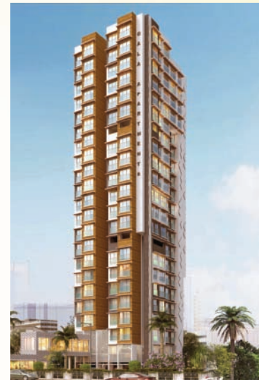
GALA Malad (E)