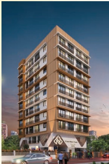
212 Apartment Goregaon (W)