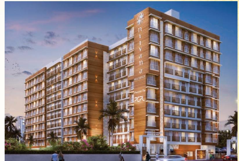
NIRVANA Malad (W)