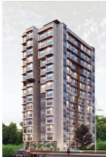
SPARSH Malad (W)