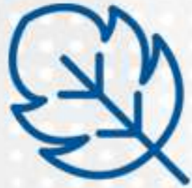
Roof Top Garden