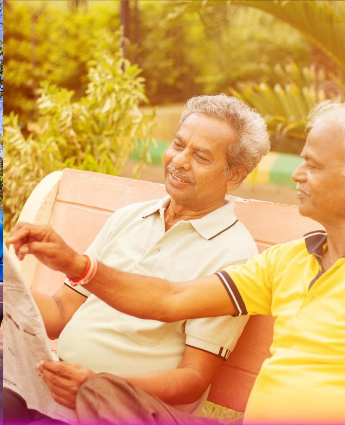
SENIOR CITIZEN SEATING