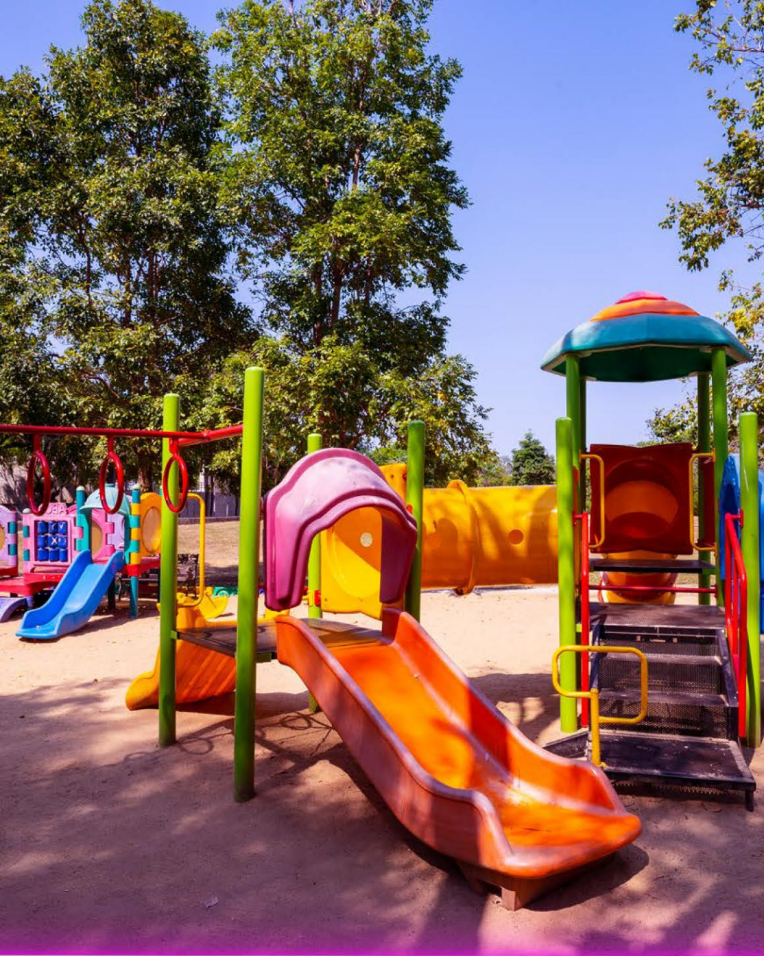
KIDS PLAYING AREA