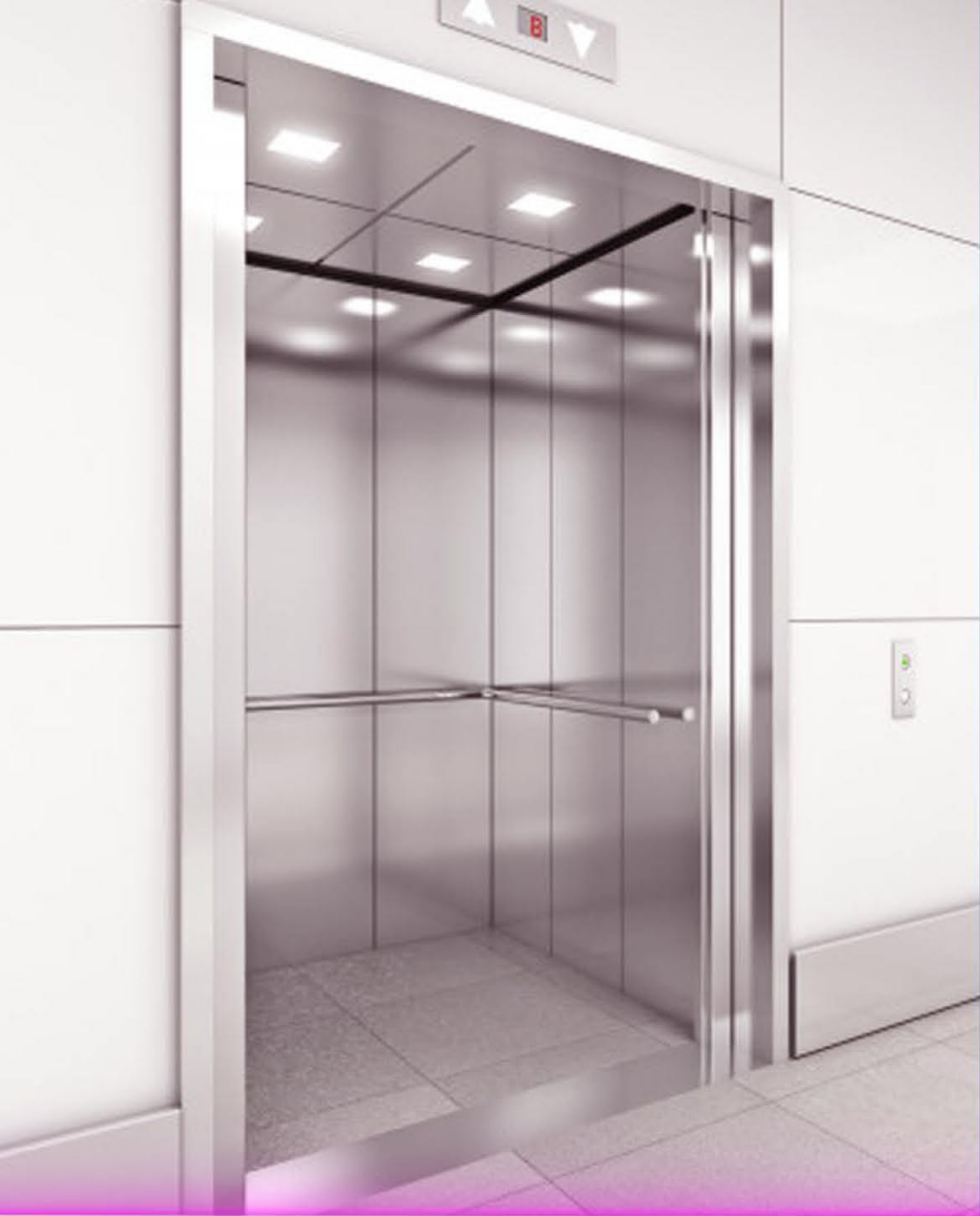
SMART AUTOMATED ELEVATORS