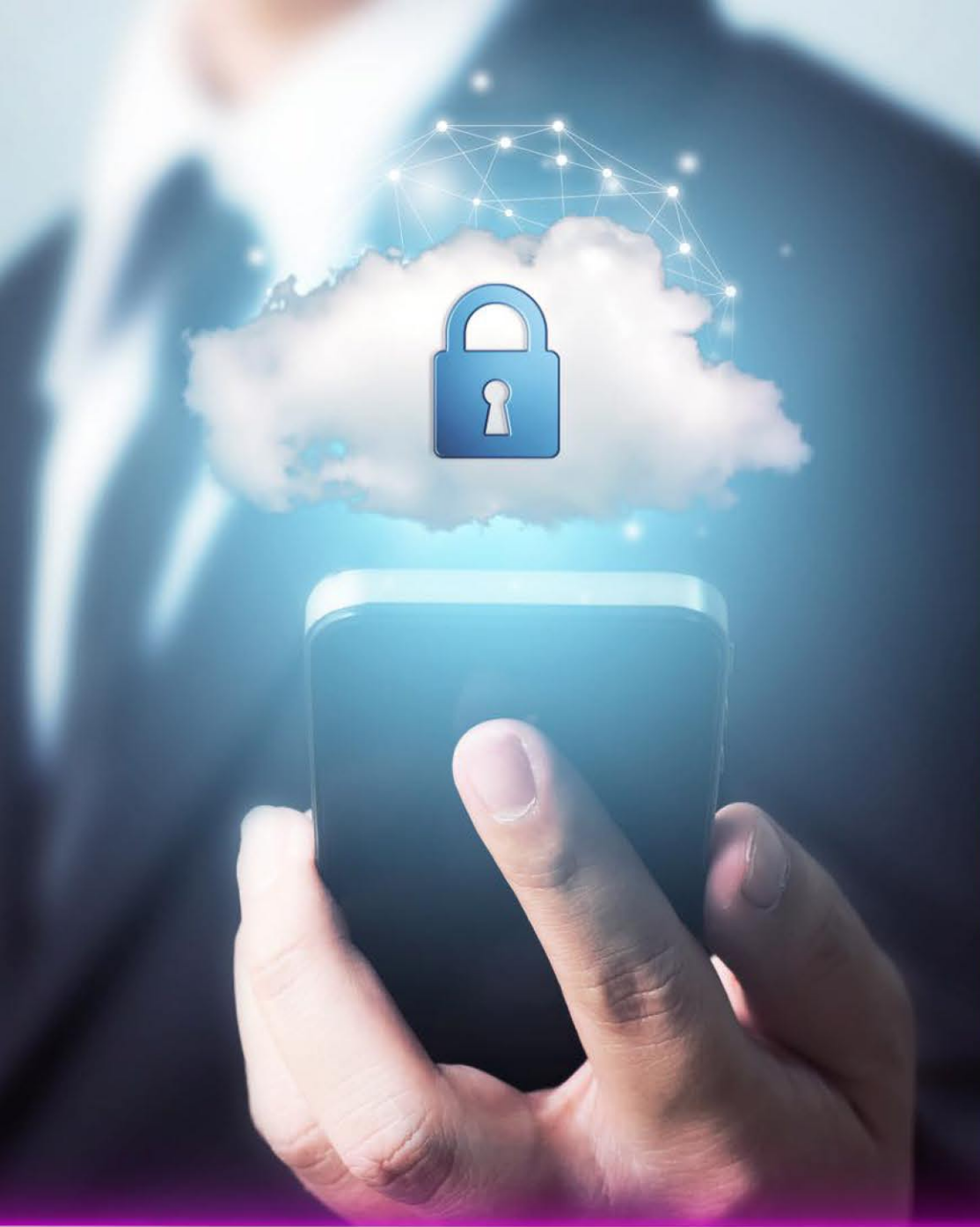
APP BASED SECURITY